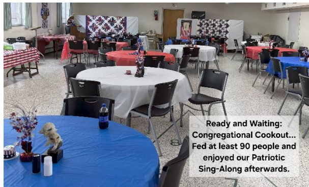
Ready and Waiting: Congregational Cookout... Fed at least 90 people and enjoyed our Patriotic Sing-Along afterwards.