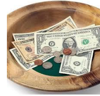
School Supply Drive